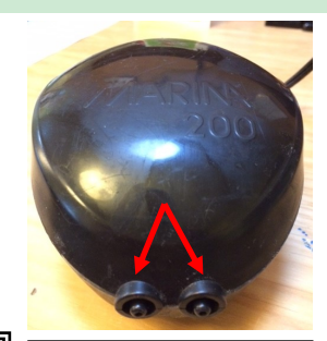
A double outlet aquarium pump is necessary for DIY brewers